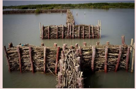
Permeable dams in Bemak district, Java.

To read more, click <u>here</u>