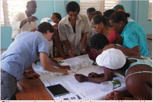
Citizen mapping can help pinpoint damage and locate risks, such as hillside instability that could threaten communities.

To read more, click <u>here</u>