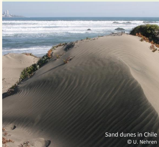
Sand dunes in Chile © U. Nehren