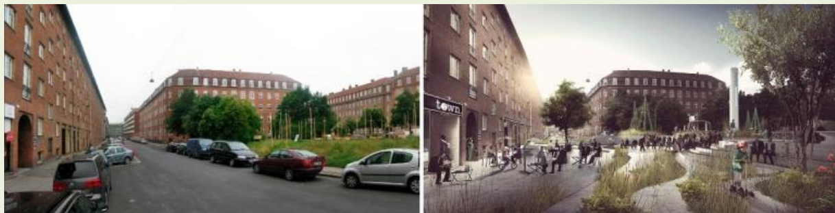
Tåsinge Square in St. Kield. ©Tredie

St. Kjeld, Copenhagen , is the first neighborhood in the world to use vegetation and water to prepare for rising sea levels and increasing floods and storms. Having to choose between grey and green infrastructures, the city planners went for the green infrastructure option, which was considered to be more economical. They noticed a lot of asphalt with no function and replaced it with a hilly, grassy carpet interspersed with walking paths. In case of a climate hazard, the mini-parks will turn into water basins, the hills essentially functioning as the sides of a bowl. With a new pipe system, the squares will even be able to collect water from surrounding buildings' roofs. Source: Al Jazeera America. Read more.