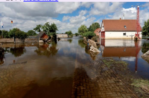
A flooded town in Germany, 2013

Read More